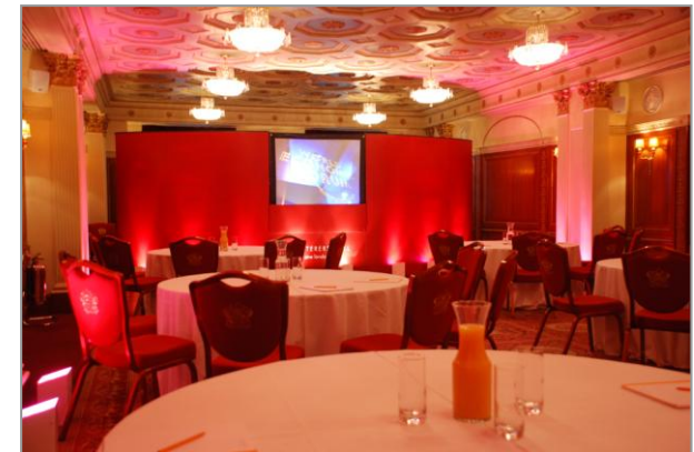
Cabaret style in Livery Hall with set